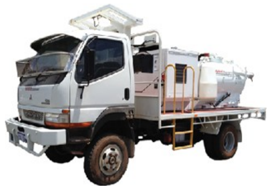
VM1000 Diesel Truck Mounted Unit