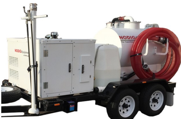
VM1000 Diesel Trailer Mounted Unit